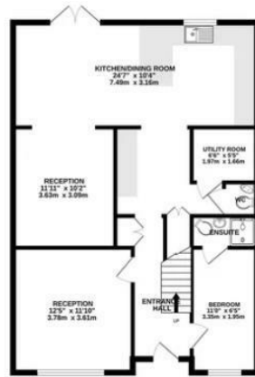
GROUND FLOOR 828 sq.ft. (76.8 sq.m.) approx.