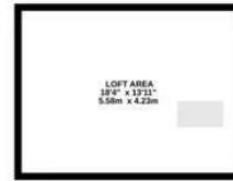
LOFT 250 sq.ft. (23.2 sq.m.) approx.